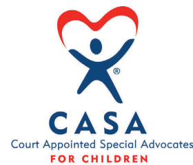
Table Sponsor ~ $500

For reservations or to sponsor, please contact Erin Carpenter 541-734-2272 | ecarpenter@jacksoncountycasa.org