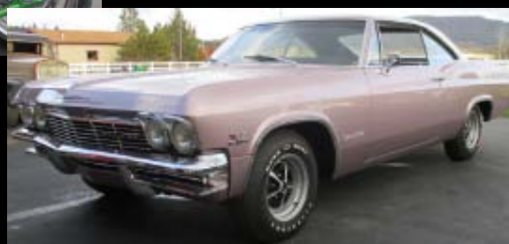
65' Impala SS 396 Clone